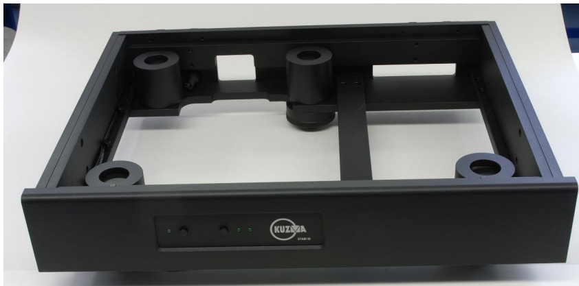
Turntable outer frame

The outer frame of the turntable, which has four decoupling towers, is heavy. Lift it, being careful not to scratch against metal parts of clothing, and position it in the middle of the supporting board. You can now level the main frame horizontally with a spirit level. Rotate the front spiked legs only. The rear leg is fixed.