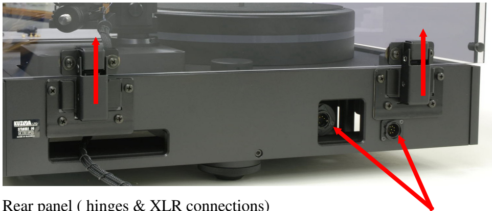
Rear panel ( hinges & XLR connections)

It is necessary to readjust the height due to the added weight. Do this as described before, by levelling it with outer frame and re check horizontally with spirit level.