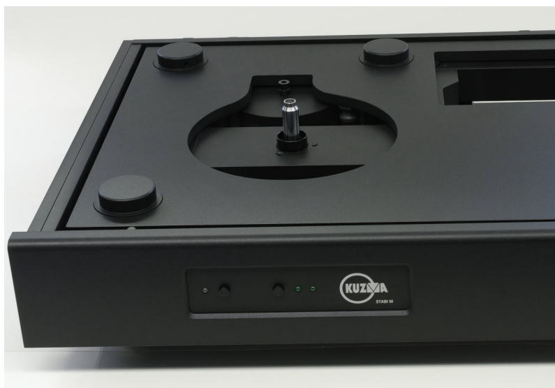
Front panel & top plate knob height adjustment