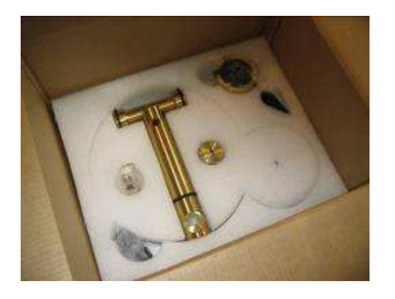
Unpacking: T base and parts Fig 3.

Optional: Stogi S tonearm with its own accessories Clamp ( in box- see Fig 3) Wooden platform (on top of the box)