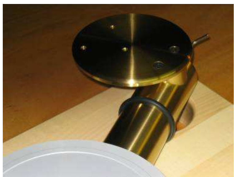
Circular brass armbase Fig 7.

The Rega RB 300 tonearm can fit directly into the hole in the brass pillar. The hole in the brass pillar should be turned away from the platter bearing and a thin tube inserted over the tonearm's base. Finally the tonearm should be fixed by an Allen key into the brass pillar.