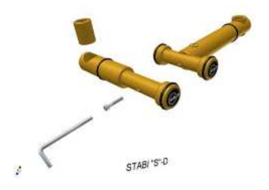
Second tonearm SD kit

Upgrades: adding second tonearm adaptor, power supply or 12 inch version tonearm are available, as well extra platter: