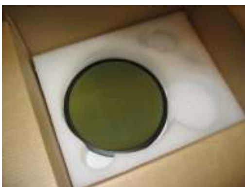
Unpacking: platter Fig 5.