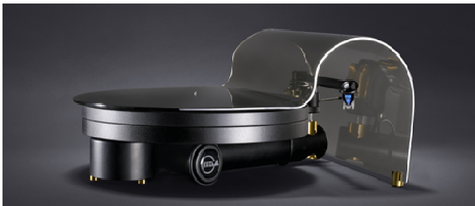
Platter S kit