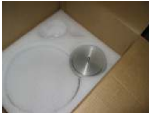
Unpacking: subplatter Fig 4.