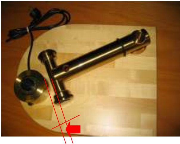
Position T base + motor tower Fig 6.

Remove the foam and lift the main T base ( Fig. 3) of turntable carefully as it is heavy and put it on a shelf so that the side with the bearing is situated at 8 o' clock and the side with the tonearm mount at 2' o clock. See Fig 6.