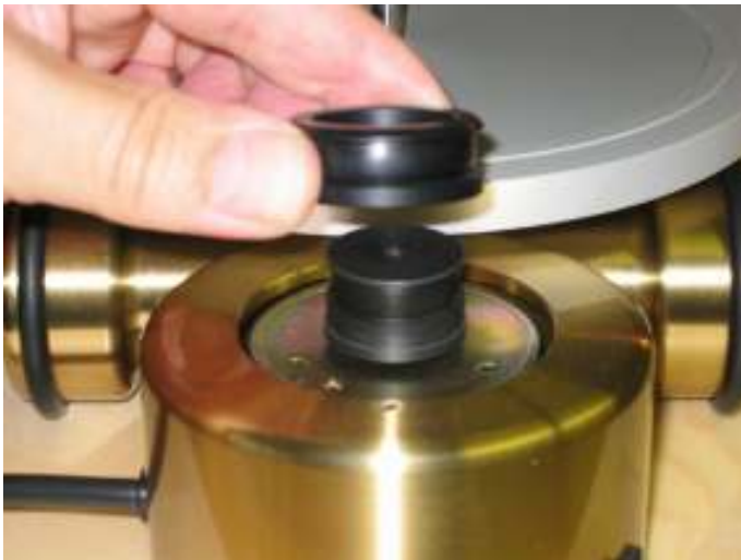
45 rpm crown ring adaptor Fig. 8.

The pulley fitted is for 33 rpm. Find the black plastic crown pulley ring which fits over the existing motor pulley increasing the diameter of the motor pulley and bringing the speed up to 45 rpm. To do this the platter must first be removed and, with clean fingers, stretch the belt away from the motor pulley while, with the other hand, pushing down crown pulley ring. Make sure the thicker ridge goes down. See Fig. 8. Return platter. To remove the crown pulley reverse the procedure.