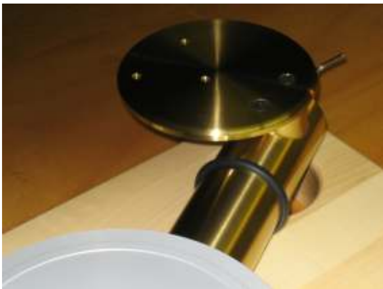
Circular brass armbase Fig 7.

The Rega RB 300 tonearm can fit directly into the hole in the brass pillar. The hole in the brass pillar should be turned away from the platter bearing and a thin tube inserted over the tonearm's base. Finally the tonearm should be fixed by an Allen key into the brass pillar.