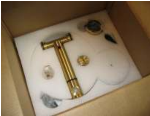
Unpacking: T base and parts Fig 3.