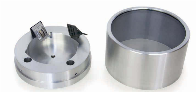
Headshell container 4

RD kit will allow you to submerge records in the ultrasonic cleaning bath and position them in a suitable drying position.