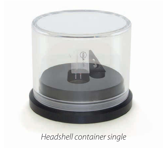
Headshell container single