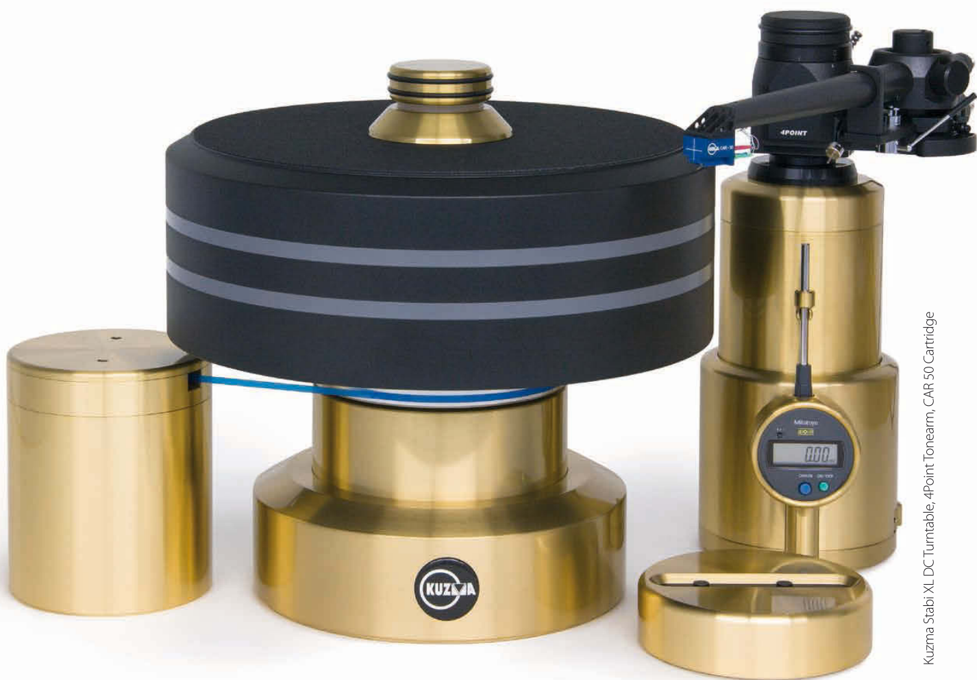
Kuzma Stabi XL DC Turntable, 4Point Tonearm, CAR 50 Cartridge