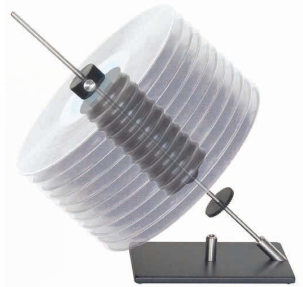
RD Ultrasonic kit

RD kit will allow you to submerge records in the ultrasonic cleaning bath and position them in a suitable drying position.