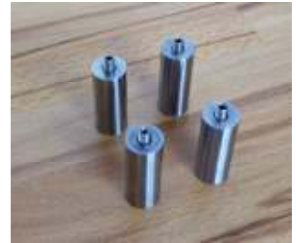
8 pcs extension legs included