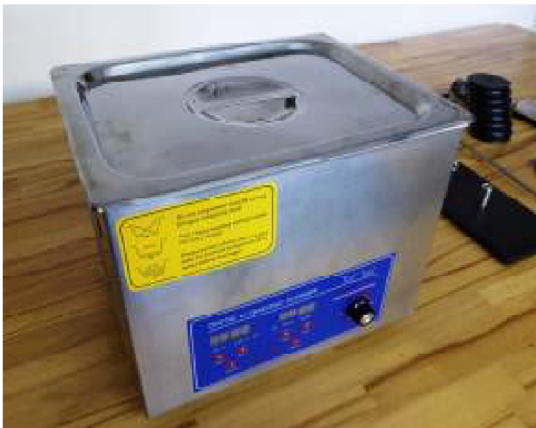
Ultrasonic cleaner bath- typical sample