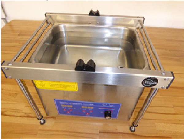
Frame is positioned over ultrasonic (US) cleaner bath

The main frame is positioned around the ultrasonic cleaner bath. Records are placed with spacers on the spindle fitted on the stand. The spindle holding the records is then positioned on top of the frame where the motor slowly rotates them in the bath.