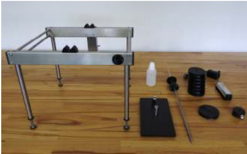
RD kit ( rotating and drying)