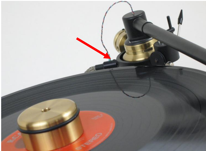
Fig. 5. See cable fixing