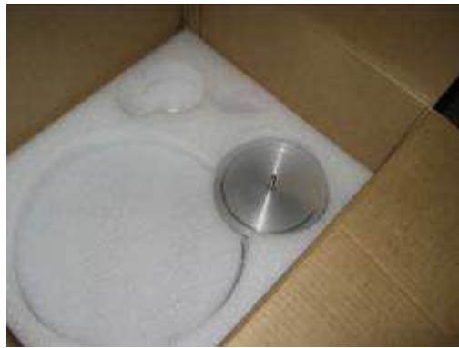
Unpacking: subplatter Fig 4.