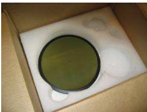
Unpacking: platter Fig 5.