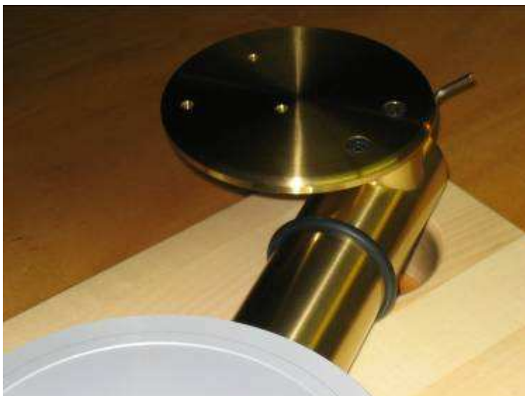
Circular brass armbase Fig 7.

The Rega RB 300 tonearm can fit directly into the hole in the brass pillar. The hole in the brass pillar should be turned away from the platter bearing and a thin tube inserted over the tonearm's base. Finally the tonearm should be fixed by an Allen key into the brass pillar.