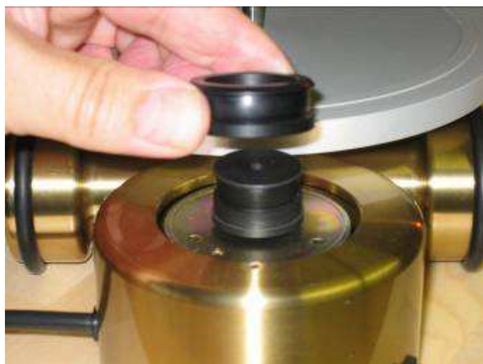
45 rpm crown ring adaptor Fig. 8.

The pulley fitted is for 33 rpm. Find the black plastic crown pulley ring which fits over the existing motor pulley increasing the diameter of the motor pulley and bringing the speed up to 45 rpm. To do this the platter must first be removed and, with clean fingers, stretch the belt away from the motor pulley while, with the other hand, pushing down crown pulley ring. Make sure the thicker ridge goes down. See fig. 8. Return platter. To remove the crown pulley reverse the procedure.