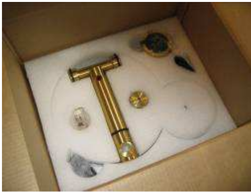
Unpacking: T base and parts Fig 3.