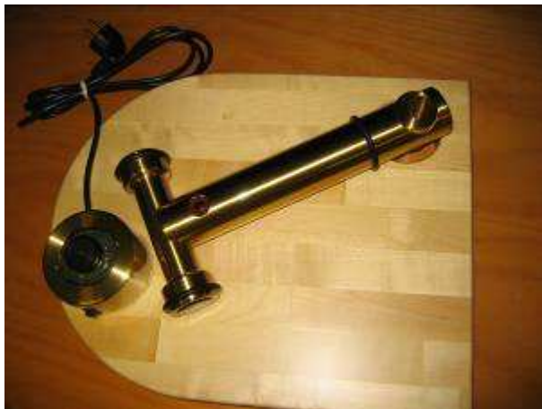
Position T base + motor tower Fig 6.

Remove the foam and lift the main T base ( fig. 3) of turntable carefully as it is heavy and put it on a shelf so that the side with the bearing is situated at 8 o' clock and the side with the tonearm mount at 2' o clock. See fig 6.